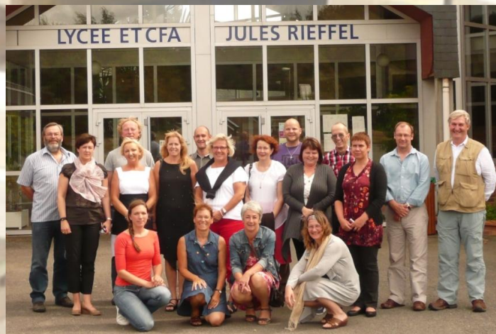
Partner meeting 3 in France